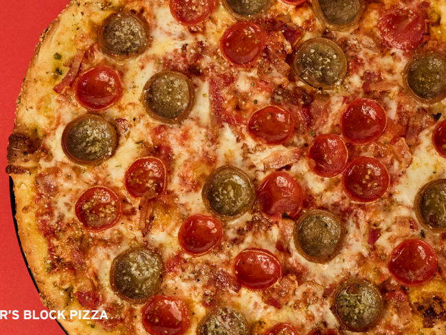
BUTCHER'S BLOCK PIZZA