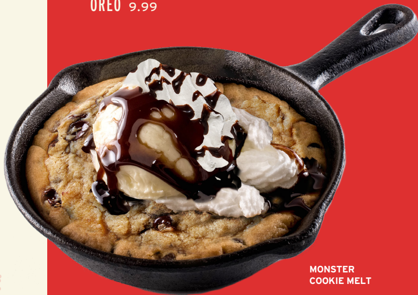
MONSTER COOKIE MELT